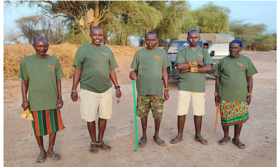
The giraffe guardians come from Rendille and Samburu communities living nearby the population