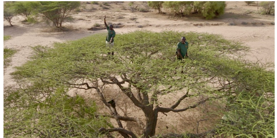
Up a Tree! Without aerial support, the best way to get a view of giraffe in this extremely flat part of the world is to climb a tall Acacia tortilis tree.