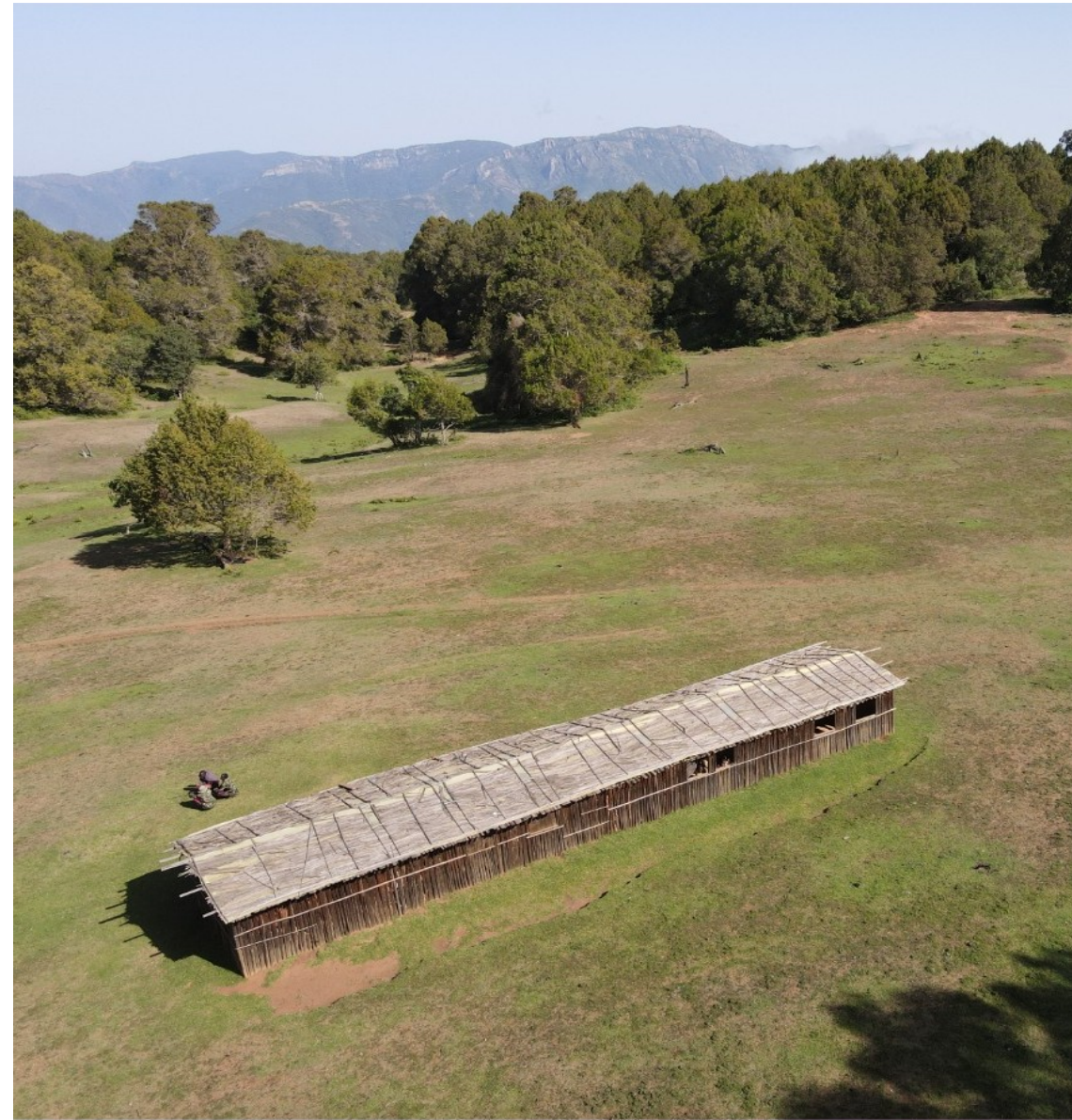
Suruan school, right at the top of the Ndoto's accessible only by a long hike!