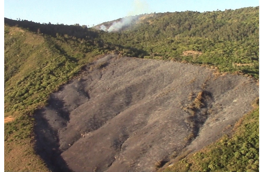
A hot fire in the Ndotos- approx 2010 - 12 years later and its only just beginning to recover!