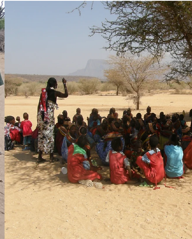
REL officer talking with Rendille people in the Kaisut desert