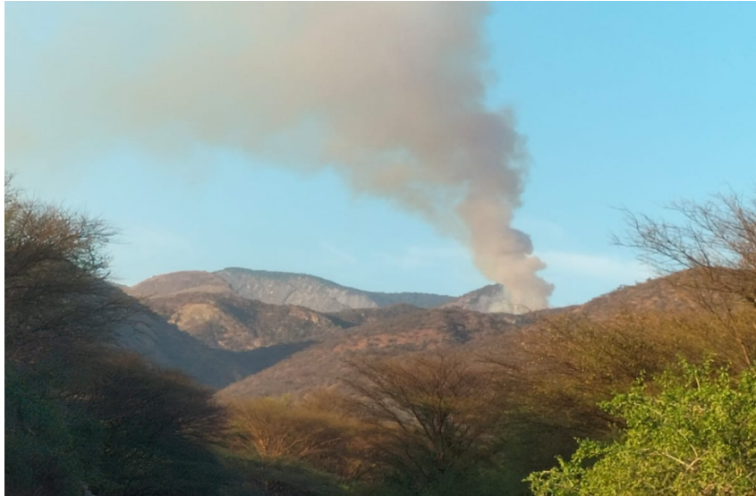
The contrast of seeing a distant plume of smoke, and then getting a closer look of the damage being done.

There is nothing comparable to the damage done by a fire. The dry forest and strong prevailing winds from the east have resulted in several hot fires, destroying centuries of growth. Our team have been in overdrive trying to deal with the multitude of fires as well as following up on the root causes.