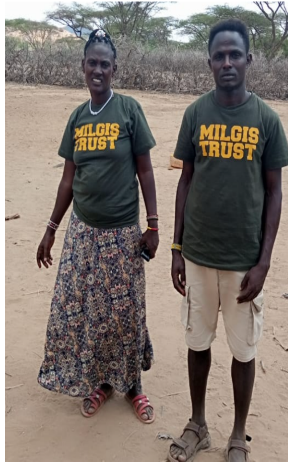
REL team members in the field

The nomadic people need space if their culture and livelihoods are to survive. This space is quickly disappearing, and therefore threatening the existence of pastoralism.